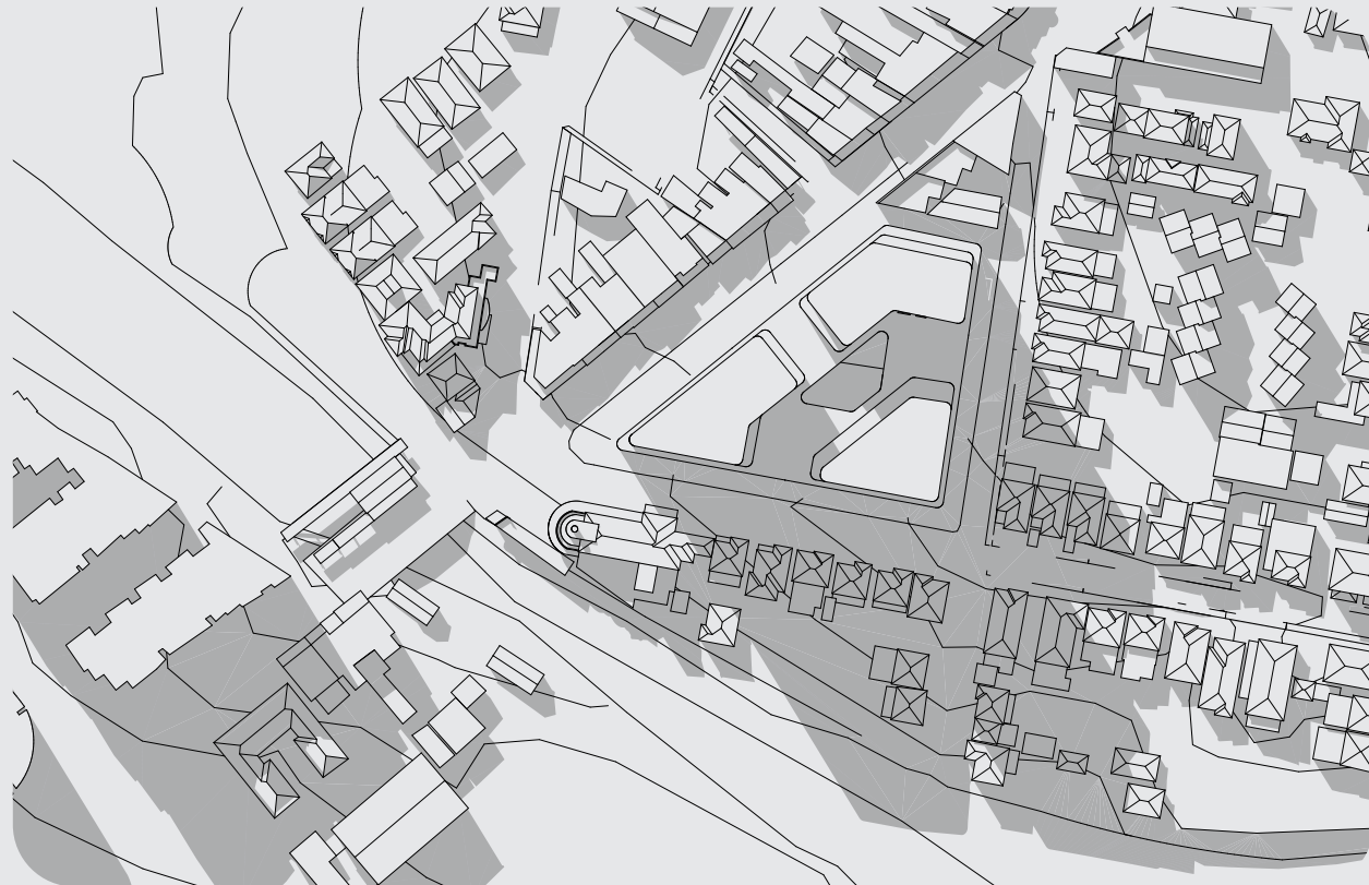
21st June 2.00pm