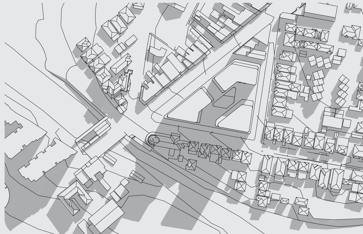
21st June 10.00am