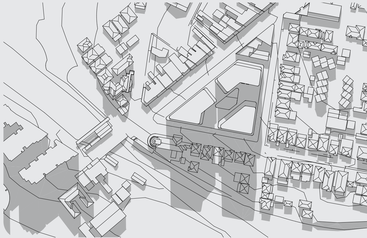
21st June 12.00pm