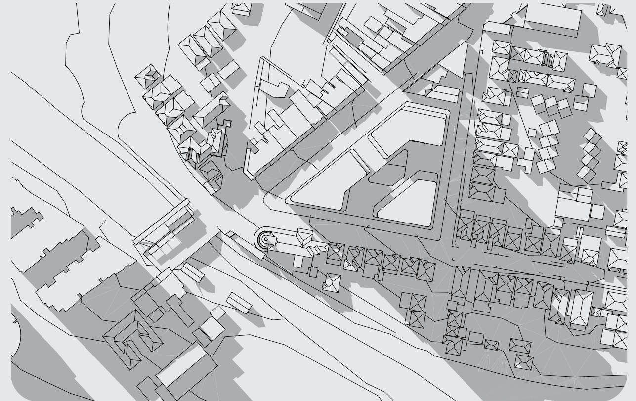
21st June 3.00pm